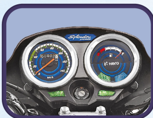
Attractive Meter Console