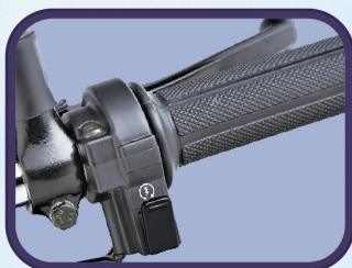
Convenient Power Start